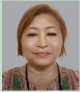
Tiakala Ao Nagaland